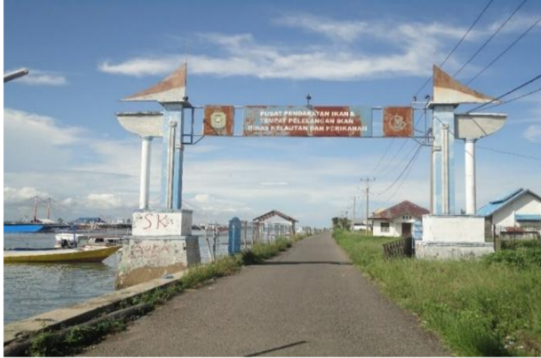
Fig.6 PPI Pontap Fish Collection Place.