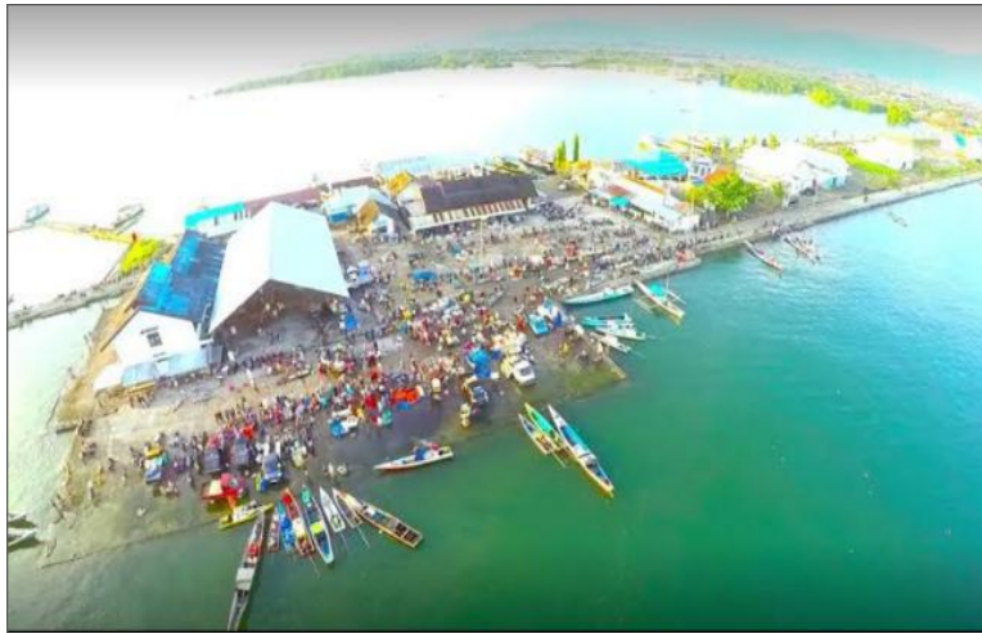
Fig.2 The location of PPI Pontap and its surroundings in Palopo City (Googlemaps, 2022).