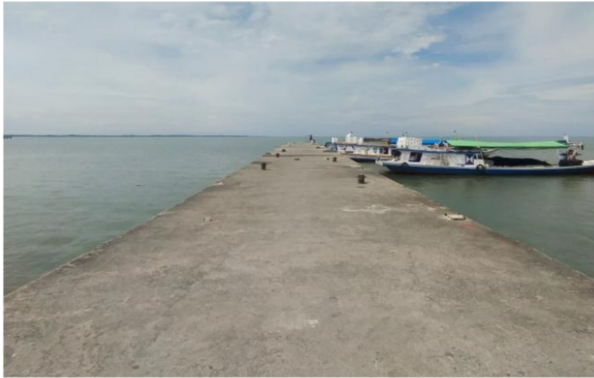
Fig.4 PPI Pontap Port Pool